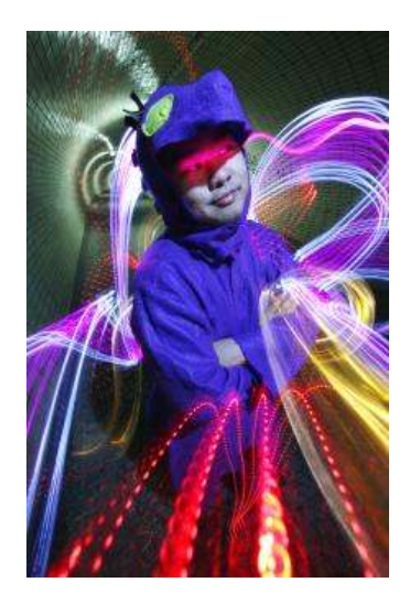
What goes on in the mind of Mochipet?

By Marcus Aurelius / Contributing reporter