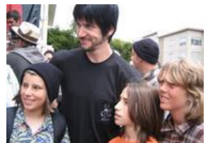
"Back to the Berg" Skateboarding Competition at Wallenberg High