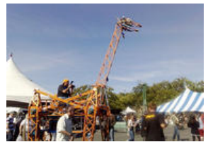
Maker Faire 2009 in San Mateo