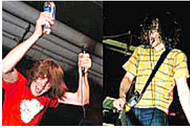
Show Faux Pas: Do Not Pee on the Floor