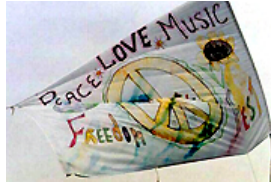
SF, NY Fight Over Woodstock Name